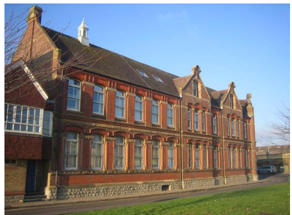
The Aveling & Porter Building, threatened with destruction