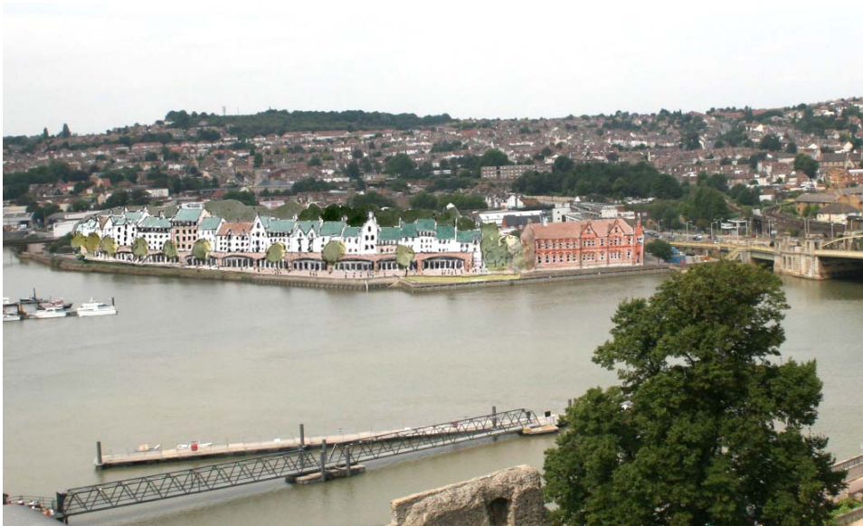
Strood's new quayside? Artist's impression by Huw Thomas, commissioned by SAVE

THREATENED BUILDING COULD TAKE PRIDE OF PLACE IN NEW DEVELOPMENT