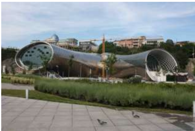
The offending ‘tubes’ by Massimiliano Fuksas