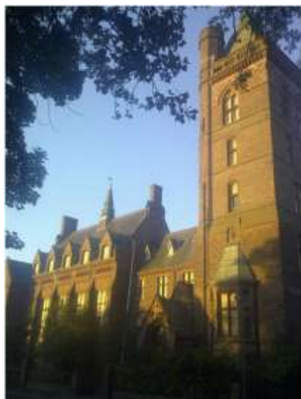
Royal Liverpool Seamen's Orphanage

Its overseas owners have maintained a live-in security presence and undertaken basic repairs, but have proved elusive to contact for many years. Thanks to the work of a local community group, with support from SAVE, local MP Steven Twigg is in dialogue with the owners' agent, who has started to promote the building for 'meanwhile uses' such as ghost tours and filming. At the same time, a community group have secured £10,000 for an initial feasibility study, which it is hoped will be a step towards stimulating developer interest and a possible Heritage Lottery Fund bid.