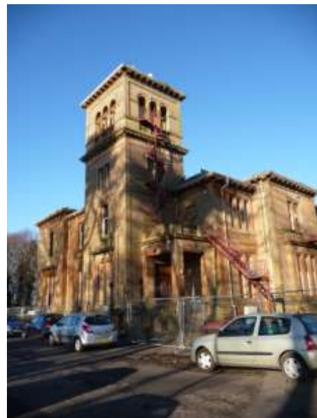
Seafeld House, Ayr

The battle to save Seafeld House in Ayr continues. This handsome Italianate house with splendid campinile tower was built for Sir William Arrol the engineer-contractor of the Forth Bridge and Tower Bridge. On his death he bequeathed it to the town of Ayr as a children's hospital and so it flourished for half a century.