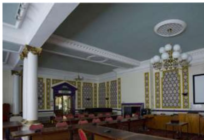
The charming interior of The Knowle

Neither the Knowle building or the Knowle Park is listed or in a conservation area. However, we are delighted to report that at a recent planning committee meeting in February the application was turned down despite recommendation for approval by the planning officer. We hope that the council will reconsider its proposal and if it does decide to submit another scheme that it will be for the reuse of The Knowle and will not involve any development of the Knowle Park.