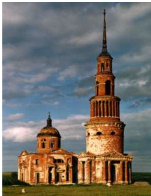
Novotroitse Church, Russia