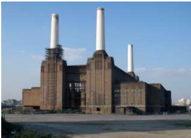
Battersea Power Station from the South

Alternative proposals were put forward by Sir Terry Farrell for preserving Battersea as a romantic ruin, and we argued that the associated turbine halls had to be preserved. Remarkably the campaign for Battersea received a completely unprecedented boost from the London Olympics. The flyover preceding the Opening Ceremony began over the chimneys of Battersea Power Station and the spectacle in the arena included a celebration of the Industrial Revolution in which a whole series of grand factory chimneys arose from the arena floor. Better still in the Closing Ceremony Battersea appeared as one of the fifteen prime landmarks of London along with Tower Bridge, the Wheel and The Gherkin.