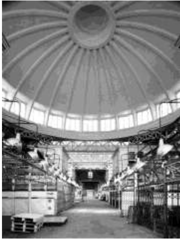
The magnificent market halls of the General Market

At the beginning of September SAVE submitted a 4,731 strong petition to Eric Pickles and Planning Minister Nick Boles, calling for a public inquiry. This followed a petition of almost 3,000 to Heritage Minister Ed Vaizey appealing to him to list the buildings. There has been considerable interest in the scheme among MPs nationwide, and in the House of Lords, including letters from Glenda Jackson and Bob Russell MPs and the Lord Cormack and Lord Salisbury.