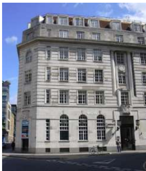
Century House, Manchester today

The local campaign group wrote to the Department of Communities and Local Government requesting that the application be called in for review, but this request was rejected, and Century House is therefore set for demolition.