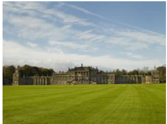
Wentworth Woodhouse.

Wentworth Woodhouse is one of the marvels of 18th century British architecture. Inspired by Colen Campbell's lost Wanstead House, it is the grandest Palladian composition in England, and at 600ft, longer than any English Cathedral. The noble portico approached by double flights of steps is of exquisite beauty. The big surprise is to find a very impressive and stylish baroque house behind the Palladian house which forms a separate private family wing with its own entrance and grand flight of steps. Built of red brick like many other baroque houses, including Beningbrough Hall near York, it has superb carved deal including a great coat of arms.