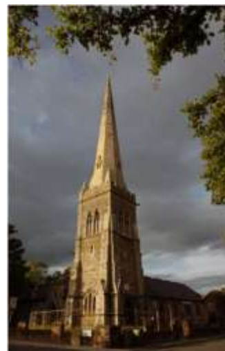
St. John the Divine

Within sight of the Littlewoods Building and St. Cyprians, the elegant spire of St. John the Divine stands proud despite the Anglican Diocese's attempt to sell the church for demolition in 2009. This is thanks to a well-run local campaign and direct intervention from SAVE, who funded a survey by structural engineers that disproved claims that the building was at imminent danger of collapse. A series of local press articles put pressure on the Bishop to seek an alternative future for the unlisted building. The latest news is that the building is back in use as a place of worship by a local evangelical church.