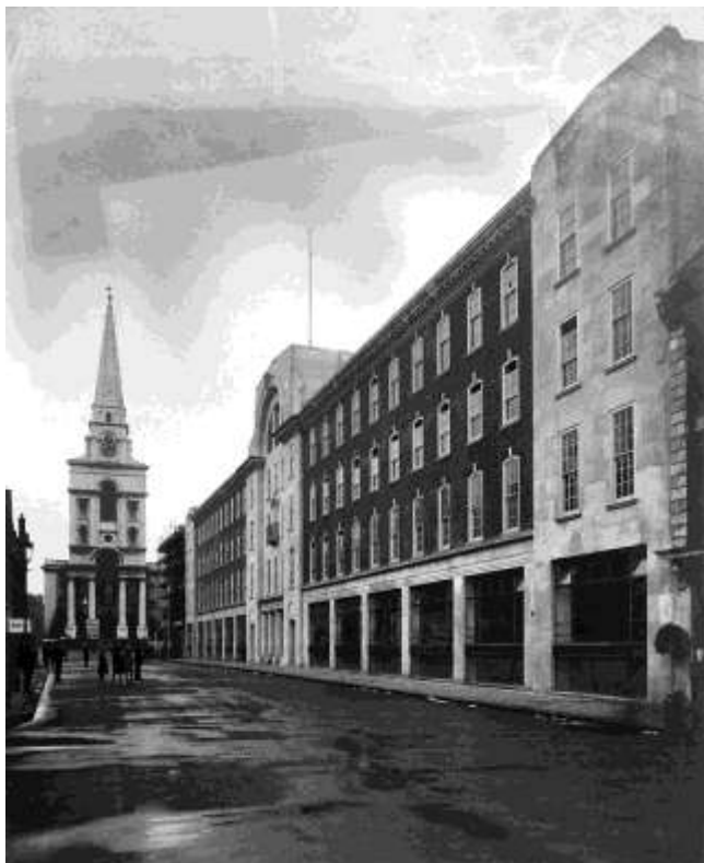
Archive photograph of the London Fruit and Wool Exchange with Hawksmoor's Christchurch in the distance.

hygiene of the shelter, and as a result he became a celebrity with his fame reaching as far as the United States.