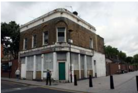
The Marquis of Lansdowne Pub, Cremer Street, London.

SAVE objected on several grounds: the pub is a corner building and one of the few historic buildings left on Cremer Street, thus plays a vital role in the streetscape. We also argued that as well as having manifest charm, the pub has a human face, both of which were absent from the Chipperfield designs. The pub is blessed with the patina of time and history, all huge assets, we felt, for a museum, especially one as atmospheric and characterful as the Geffrye. The pub is in use, as offices for two graphic design companies, and is therefore, while in need of repairs, not unsafe. The Spitalfields Trust led a strong campaign to save the building, commissioning a drawing of how it could look if repaired, and making an offer to the Geffrye to buy the site. At the planning committee meeting in May, Hackney Council rejected the application.