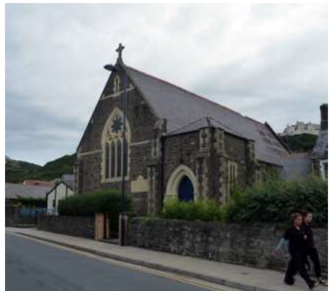
Our Lady and St Winefride's Church

In July, the parishioners' alternative scheme for the repair and reuse of the church was granted planning permission, which strengthens the case for refusing the Diocese's application for demolition.