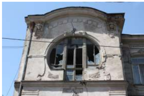
Crumbling Art Nouveau apartment block in Tbilisi, Georgia