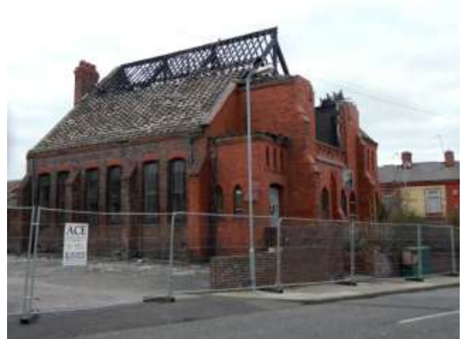
Springwell Chapel, the Klondyke, Bootle, Sefton. Demolition was halted by an injunction from SAVE.

Unfortunately SAVE was unsuccessful in the Judicial Review. The Judge, who did not have a planning background, took over six months to deliver his verdict in a bumper 108 page report. We have lodged an appeal.