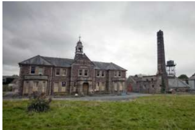
Mid-Wales Hospital, Administrative Block.