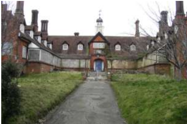
The Frank James Hospital