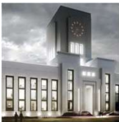
Shed KM's proposals

Last year, SAVE raised the alarm over Edge Lane's Art Deco Littlewoods Building, a magnificent white stucco industrial palace completed in 1938 by Scottish architect Gerald de Courcey Fraser, who also designed a number of department stores for Lewis's and others.