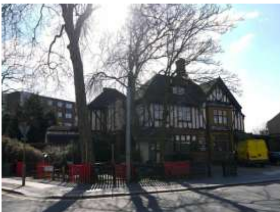
The White Bear Pub, Hendon

In March, SAVE was alerted to the imminent threat of demolition to the former White Bear pub, an unlisted building in the Burroughs conservation area in Hendon, north London. Built in 1932, the White Bear is a good example of an inter-war public house in mock Tudor style, with charming details such as an inlaid coat of arms in the windows. Although the pub ceased trading in the mid-2000s, it is still in use as a residential property.