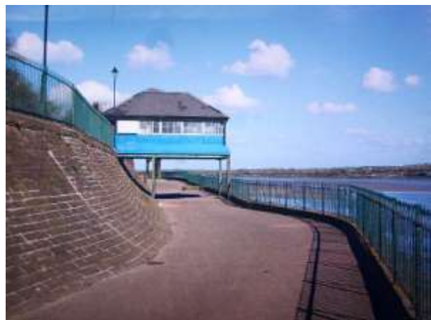
Pensioner's Hut, Widnes

Although the hut has been unused for several years, we understand it remains in a good condition and could be reopened as a community facility.