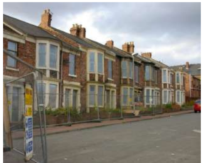
Tinned up houses in Saltwell and Bensham, Gateshead

Unfortunately we have heard since that the Secretary of State has chosen not to call this planning application in. SAVE is currently looking into ways of challenging the application. The Saltwell and Bensham Residents Association, together with SAVE, have saved hundreds of houses from Pathfinder demolitions in recent years.