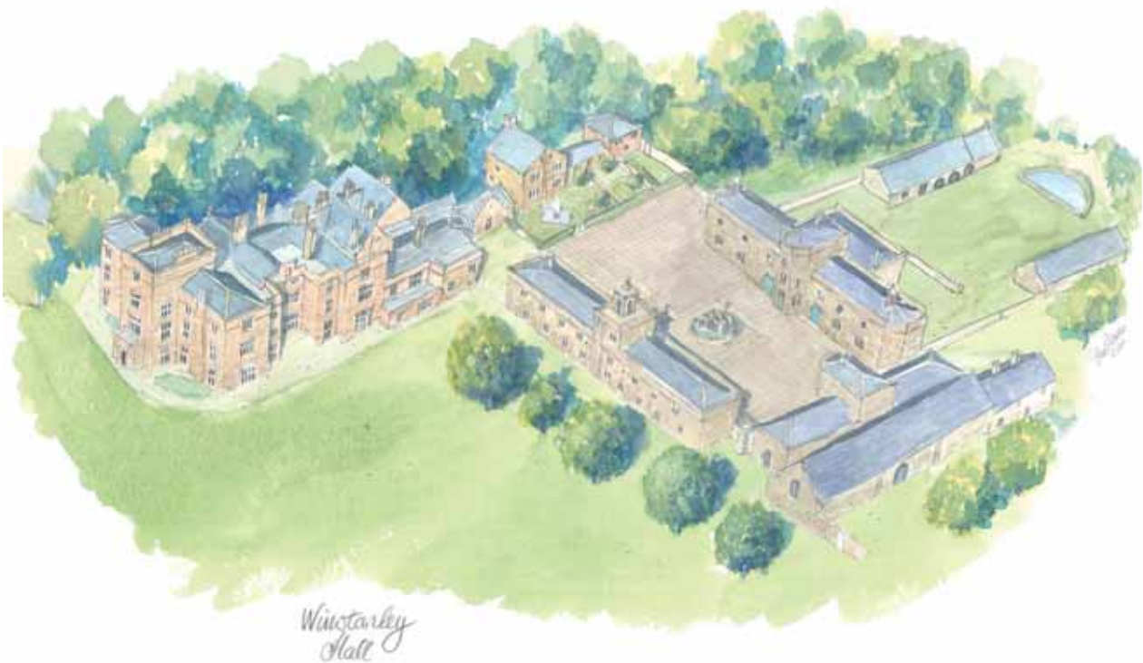
Birds Eye view by Huw Thomas showing the full extent of the house and the impressive stable court surrounded by Meyrick Banks's delightfully eccentric buildings