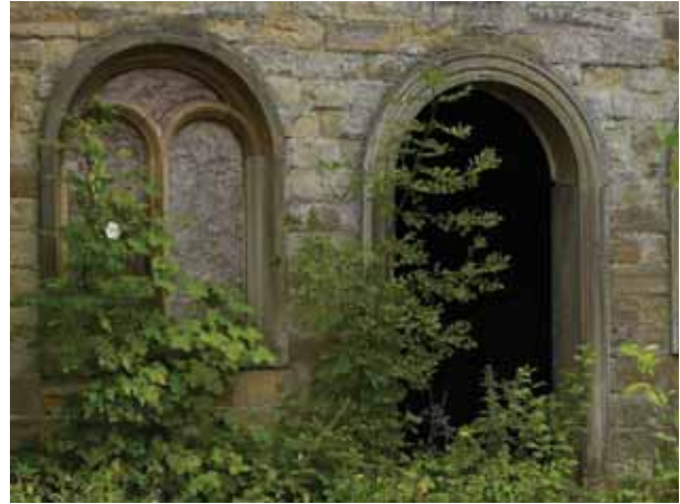
Round arches in the Norman style