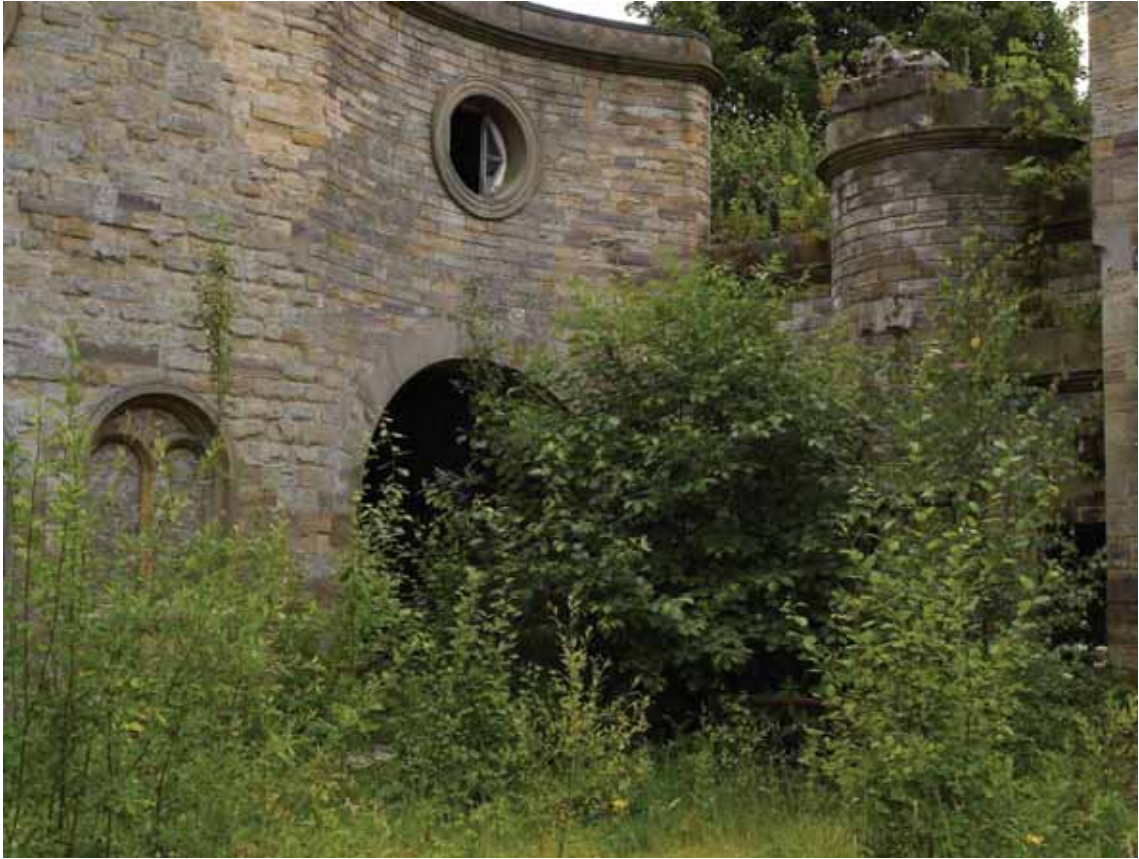
A family dog sits on a circular turret