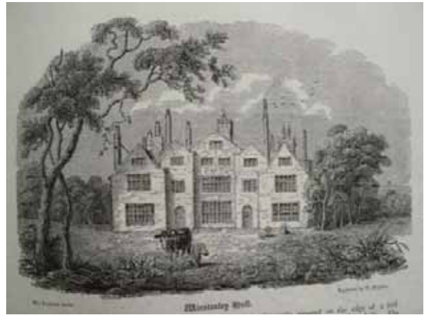
The five gabled Elizabethan front built by the London goldsmith James Bankes who bought the estate in 1595

The grounds and parkland were subject to extensive open cast coalmining in the post-war period and, subsequently, the M6 motorway was built along the edge of the parkland, clipping off one of the lodges. The grounds however have been restored after mining and the motorway is mainly in a cutting. Winstanley remains a romantic place, secluded by trees and woodland and approached by a