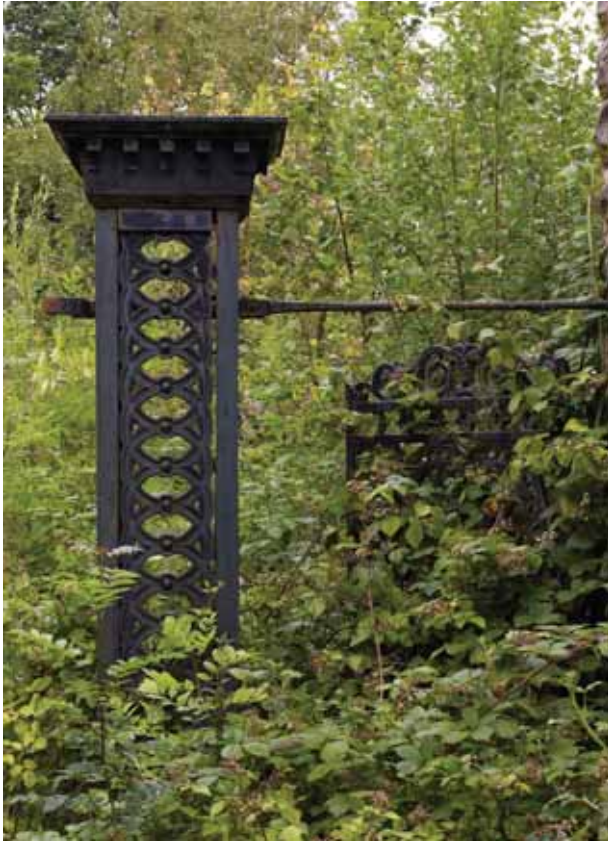
Cast-iron gatepost and gate