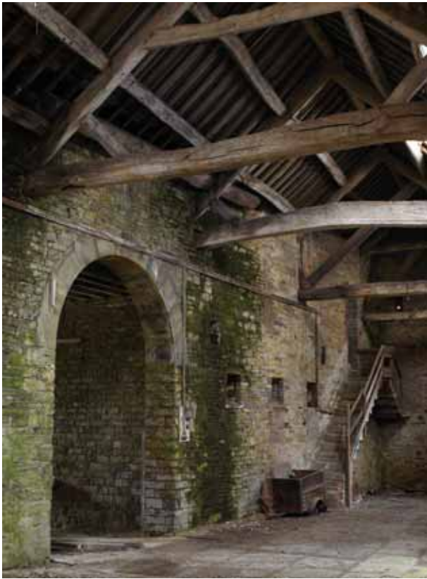
The 17th century barn is suitable as an events and exhibition space