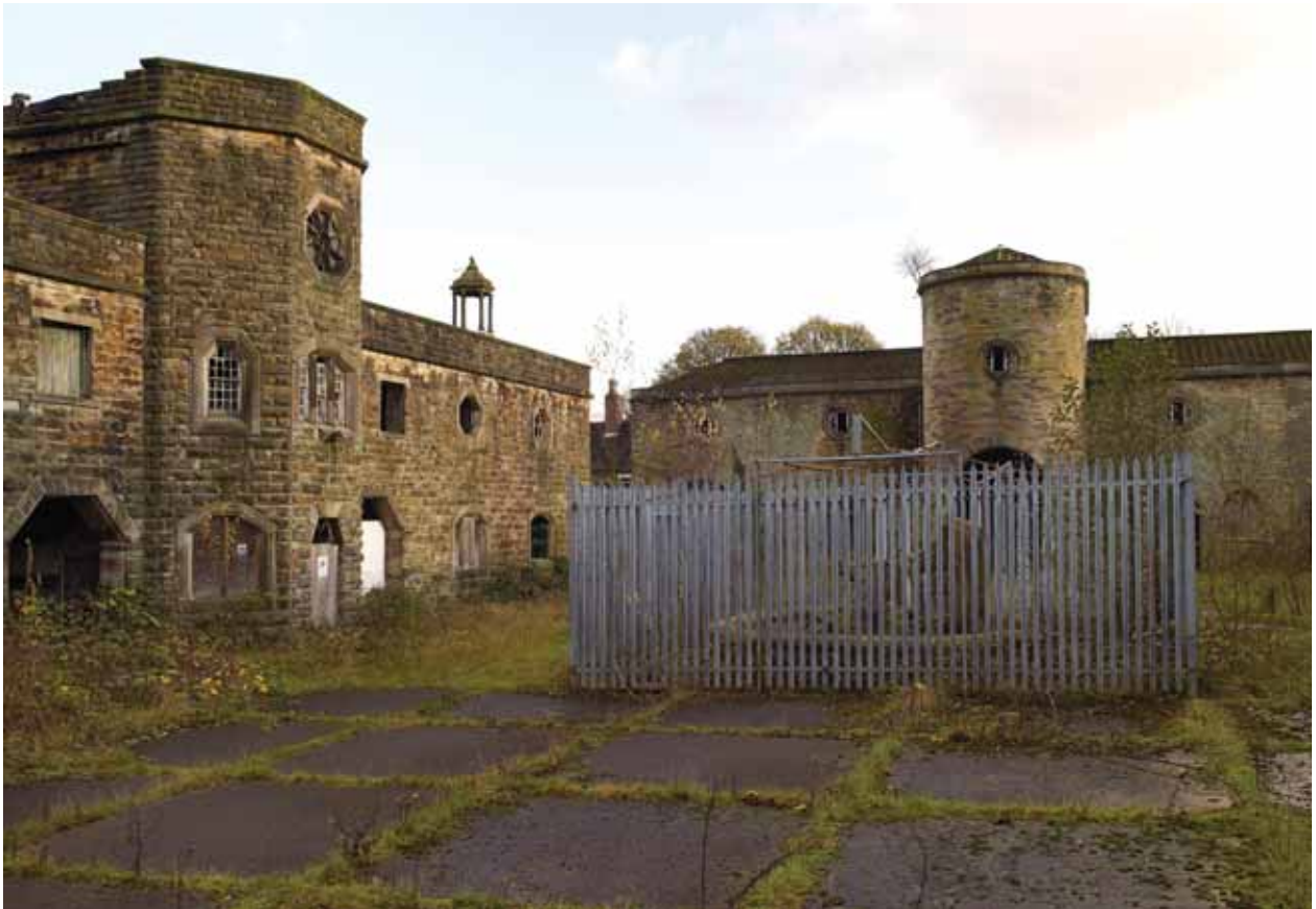
The stable courtyard built by Meyrick Banks in the 1830s is a classic example of English eccentricity