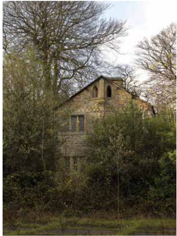
The Swiss Cottage has a hint of Celtic ornament in the masonry detail.

a 17th-century barn with strutted trusses. The south stable range with central clock tower, and octagonal windows and cupolas at the corners also dates from the 1830s. The north range, with rock-faced stone, possibly dates from c. 1859. The Neptune fountain in the centre of the stable court is by William Spence and dates from c. 1830. At the east end of the yard are the central Swiss cottage and adjoining malt house with stepped gable dating from 1884 as well as a late-18th century dairy house. A number of the Lewis Wyatt gate lodges survive.