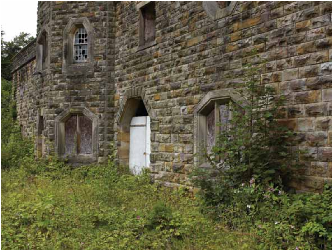
A stable range in rough hewn 'Primitive' style