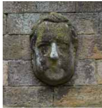
Grotesque carved head over a doorway