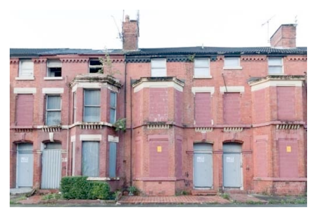
These houses in Kelvin Grove, Liverpool, were in near perfect condition before being emptied, tinned up and left to rot using HMR funding.

of renovation, is being sent to landfill, only for the vacant sites to be grassed over.