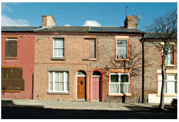
9 Madryn Street (left), Ringo Starr's birthplace and childhood home. Turned down for listing but the Housing Minister has now spoken up for the building.

Last year SAVE put forward Ringo Starr's home in Madryn Street for listing (together with a group of other Beatles-related sites in Liverpool). Just before Christmas we heard that English Heritage (EH) had turned down the house for listing. The next day they announced that the 'iconic' Abbey Road zebra crossing once traversed by the Fab Four had been listed. We remain slightly nonplussed by this decision, partly as we consider that the cultural significance of Ringo's birthplace was not properly considered, and partly because we didn't actually know it was possible to list a pedestrian crossing.