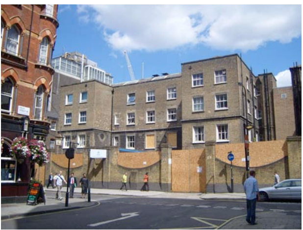
Listed at last: the threatened former workhouse on Cleveland Street.

Elsewhere, the efforts of another NHS Trust to demolish a historic hospital building appear to have been thwarted by the Culture Secretary. An application had been submitted for the redevelopment of the former Strand Union workhouse on Cleveland Street in central London (close to the site where the Middlesex Hospital once stood) but in March, following a high-profile campaign and a recommendation from English Heritage, the building was listed.