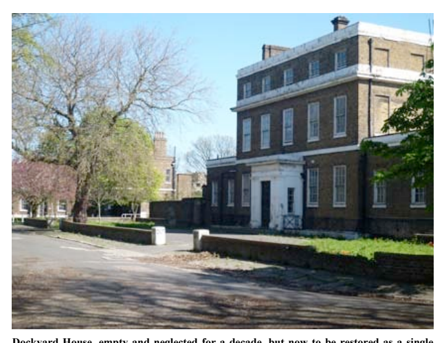
Dockyard House, empty and neglected for a decade, but now to be restored as a single home.

The Spitalfields Historic Buildings Trust, acting as the nominee for a group of investors, and with the help of a loan from the Architectural Heritage Fund, has successfully sealed the £1.85m purchase of a complete 1820s naval officers' residential quarter at Sheerness Dockyard. The site, on the Isle of Sheppey, Kent, contains six Grade II* and four Grade II buildings on four acres of land. It has been empty (save for one protected tenant) and on English Heritage's national at risk register for the best part of a decade.