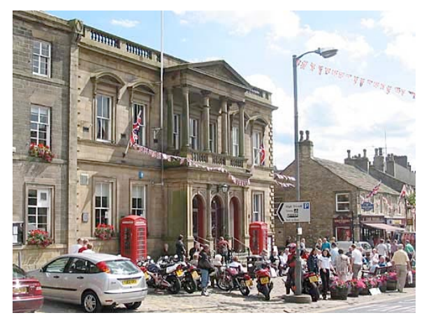
Skipton Town Hall, under threat from damaging development plans.

In December, we were alerted to worrying plans for a new shopping centre in the historic town of Skipton. The development was to abut and obscure the rear elevation of the fine Grade II listed Town Hall. As well as blocking out light, the development would have hindered access to the Town Hall's grand assembly room, therefore threatening the long-term sustainability of the listed building.