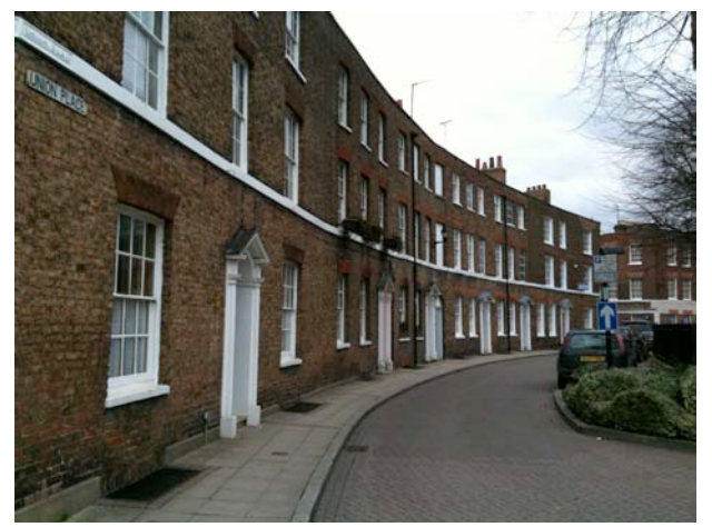
The Crescent, Wisbech, developed c.1800 by Joseph Medworth.

crescent (pictured) and square. There are also many good surviving shopfronts in and around the town centre.