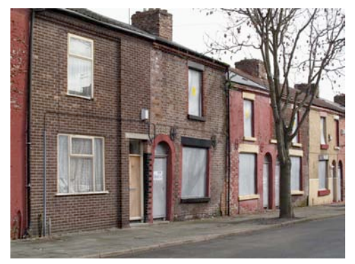
Madryn Street, with SAVE's house on the left.

In an unprecedented move, the last private owner in Madryn Street - in the heart of the Welsh Streets clearance zone in Liverpool - has agreed to sell his home to SAVE. The house, 21 Madryn Street, is a few doors down from the birthplace of Ringo Starr and is one of nearly 300 destined for clearance under the Welsh Streets Pathfinder scheme.