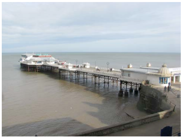
Cromer Pier, home of the Pavilion Theatre.

despite the great efforts of the CPS - working in partnership with the council - it still faces problems. One of the main threats to the special character of the town is the incremental loss of detail - a process which is difficult to control through the planning process, even with buildings which are listed or which stand in conservation areas. UPVC windows are a constant menace and SAVE was pleased to learn that the council is considering introducing more Article 4 directives in conservation areas. These directives control the alteration or replacement of specific features by requiring owners to seek planning permission. Although owners may initially be resistant to such directives, once they realise that the purpose of these controls is to preserve the distinct and special qualities of a place, improving both quality of life and house values, they will often come out in support of them. Controls like this are particularly important in a town like Cromer which owes its charm not to spectacular individual buildings, but to groups of good buildings, satisfying streetscapes and delightful, incidental, views.