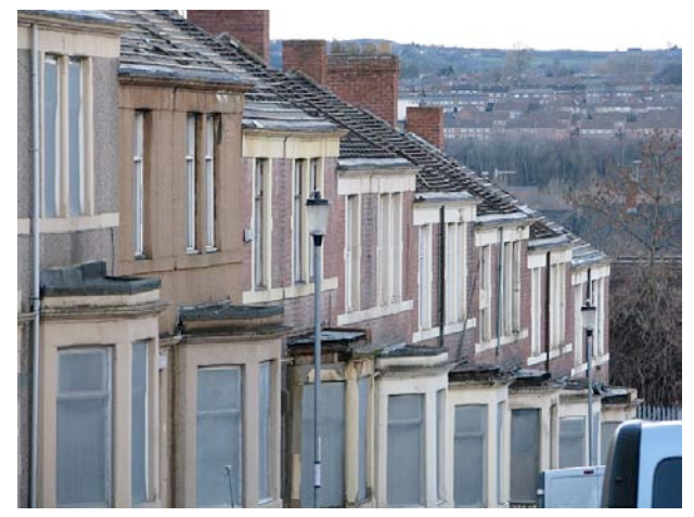
Armstrong Street in Bensham, Gateshead. One of several streets of good late Victorian houses, emptied, left to rot and now destroyed by the Council, following the lifting of SAVE's injunction in December 2010.

It is extraordinary that at a time when local authorities are facing substantial budget cuts some councils are continuing to flatten valuable assets. One of the most heartbreaking and scandalous cases involves an area of terraced housing in Bensham, Gateshead. Readers may have been following this case, both in previous SAVE Newsletters and in the national press. SAVE was first made aware of the demolitions - which were part of a Pathfinder scheme - in 2006, when we were contacted by the Saltwell and Bensham Residents Association (SABRA), but became more involved in 2008 when we initiated court proceedings against the council.