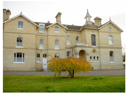
Oakland Hall in the grounds of Elvian School. The windows have been removed since this

SAVE was concerned that the school, owned by the Society of Licensed Victuallers, was claiming that these two substantial, well-designed and well-maintained houses were 'not capable for conversion to a viable form of use.' They had also been turned down for listing which was being used as an argument for their destruction.