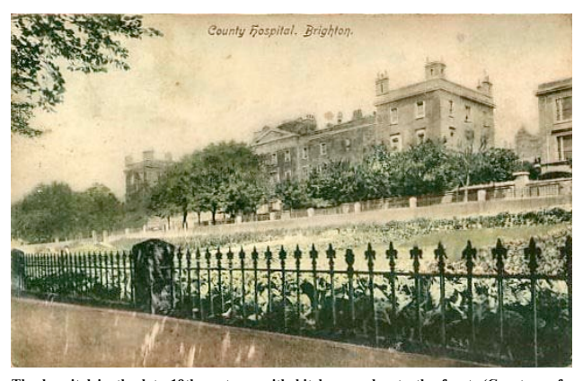
The hospital in the late 19th century, with kitchen garden to the front.

Remarkably, other than the chapel, the building remains unlisted (it was turned down by English Heritage in 2009), and now the local NHS Trust has proposed flattening the site for a new hospital. The proposals have caused an outcry - with objections from local and national conservation groups, including the Victorian Society. SAVE has objected and has also published a 'lightning' report on our website.