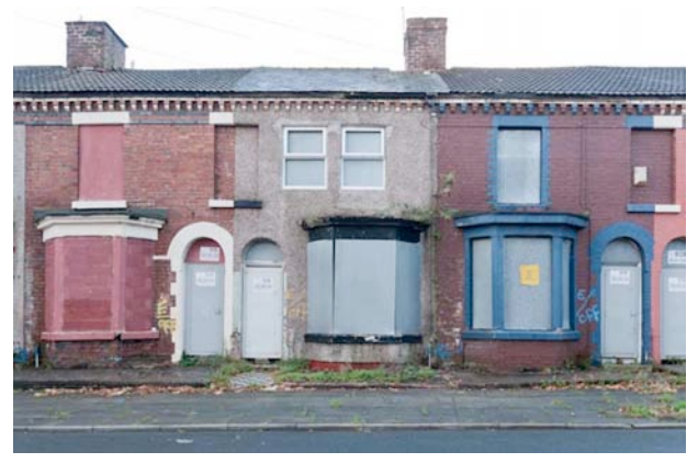
Only five years ago these Welsh Streets houses were inhabited and in good order. Photo:

It is the first time SAVE has managed to get a foothold in a Pathfinder area. Our aim is bring national attention to the plans for wiping out this once thriving historic neighbourhood. We will refurbish the house and make it available to the community for events and activities. We also hope that the Beatles tours, which visit the street daily, will use it as a base in the area.