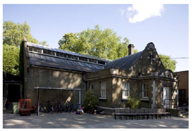
The swimming pool at the Foundling Hospital. A precious fragment of the working hospital.

These two (sadly unlisted) buildings are rare surviving elements of the Foundling Hospital in London, most of which was demolished in 1926. They date from a later phase in the development of the hospital at the end of the 19th century. Both buildings make a positive contribution to the Bloomsbury Conservation Area in which they are sited.