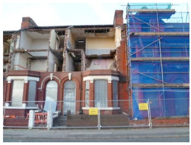
SAVE's landmark judgment means that Pathfinder demolitions will face tighter controls and be subject to closer scrutiny

SAVE has secured a landmark court judgment which gives new protection to buildings threatened with demolition. The ruling means that most forms of demolition previously exempted from planning controls could now need planning permission.