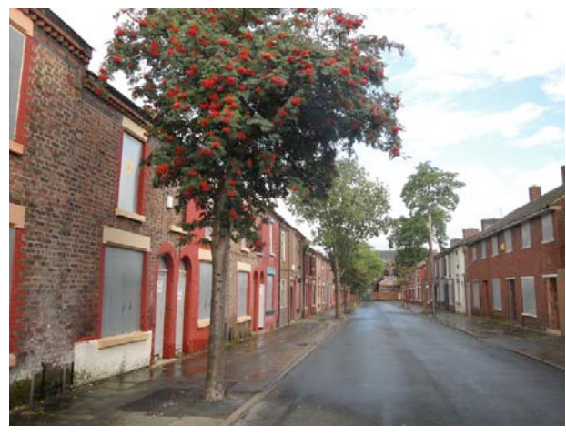
In the balance: Madryn Street in Liverpool part of the Welsh Streets clearance zone. The housing minister has intervened to request that the council examines alternatives to demolition.

The battle to SAVE the Welsh Streets area of Liverpool from the bulldozers is reaching a critical stage. In the latest twist to the saga, Eric Pickles, Communities Secretary, has intervened at the eleventh hour to issue a stay of execution. Plans for demolition were approved by the council at a meeting on 19 April, in the face of widespread opposition, but Pickles has now issued the council with an Article 25 Direction which prevents the council from issuing permission until he has considered a request by SAVE to require a full environmental assessment.