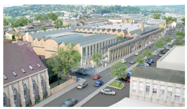
The Bath Press building. Tesco proposal to demolish all but the façade for a new supermarket.

The architectural and historic importance of the Bath Press building, a former book manufacturing plant, is already recognised by its inclusion on Bath Council's local list. It dates from 1889 but most of the site was developed between 1929-34. The long, low, classical stone façade is the building's most prominent and impressive feature. The building was vacated in 2003 and added to our Buildings at Risk Register in 2008.