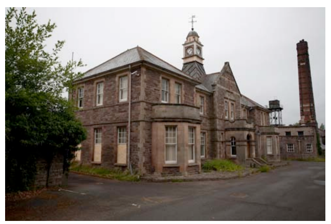
Talgarth Hospital.

SAVE has been trying to raise awareness of this building and has contacted a developer with experience of converting a former hospital to flats. We believe residential conversion is the best (and most sensitive) option for the building but current permission is for mixed-use only (there is a pressure for any scheme to deliver employment opportunities). We have written to the council urging a change of policy.