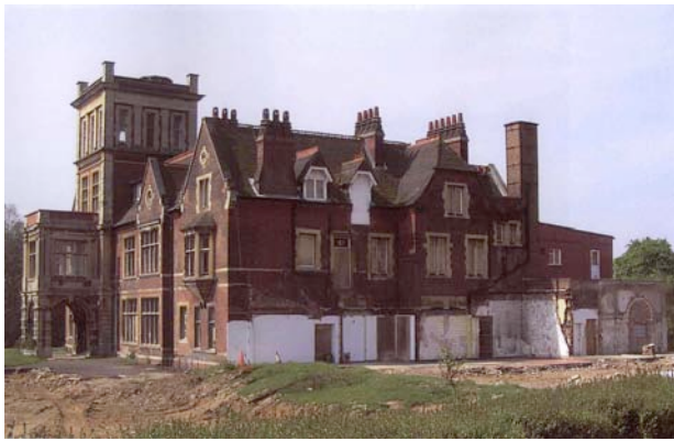
Athlone House , with its distinctive tower