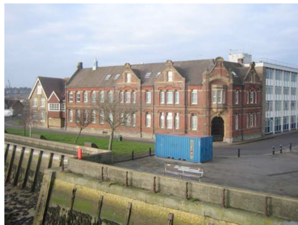
Built in 1903, the A&P building occupies a fine position overlooking the Medway with views towards Rochester Castle