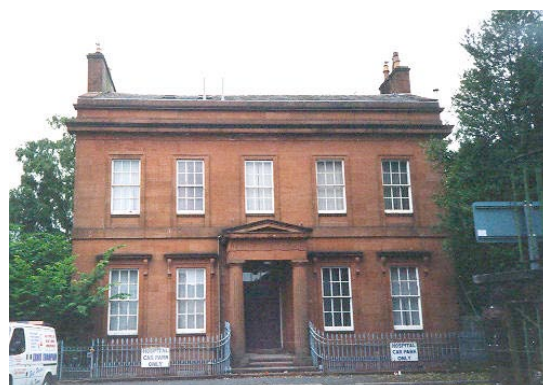
Moat Brae House, Dumfries, birthplace of Peter Pan