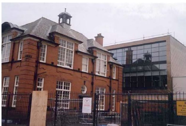
Leigh Grammar School, side by side with its modern replacement. The original school building, which is in excellent condition, faces demolition in January

pilasters and lintels fashioned in brick (characteristics of Littler's work). The large windows on the second floor extend above the cornice level of the roof, forming elegant dormers. These, together with the bellcotes and chimneys, create the building's distinctive and pleasing roofline.