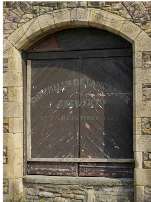
Mitchell's, pride of Lancaster?