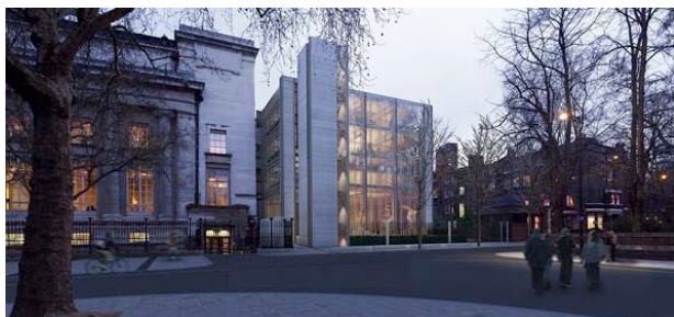
A view from Malet Street of the proposed north-west extension to the British Museum, designed by Rogers Stirk Harbour & Partners. The block on the right replaces two replica Georgian houses

A new application has been submitted for the controversial north-west extension of the British Museum. The previous application was turned down by Camden Council in the face of strong opposition, despite support from English Heritage.