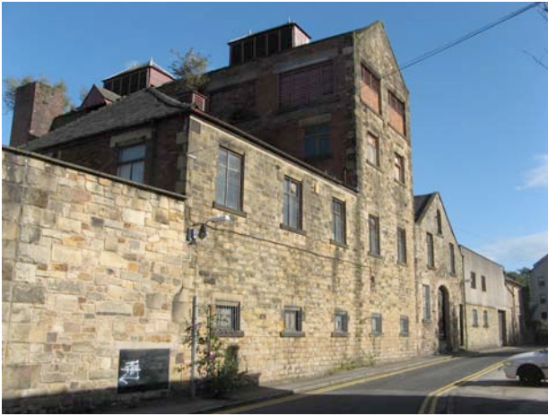
Mitchell's Brewery, Lancaster, a rare surviving brewery complex incorporating an 18th-century malthouse.

With the result of the Lancaster Canal Corridor Public Inquiry due in the New Year, a fierce battle has begun to save a key building at the centre of the proposed redevelopment site. Currently, Mitchell's Brewery, a rare and important complex which includes an 18th-century malthouse, is unprotected by listing or conservation area designation.