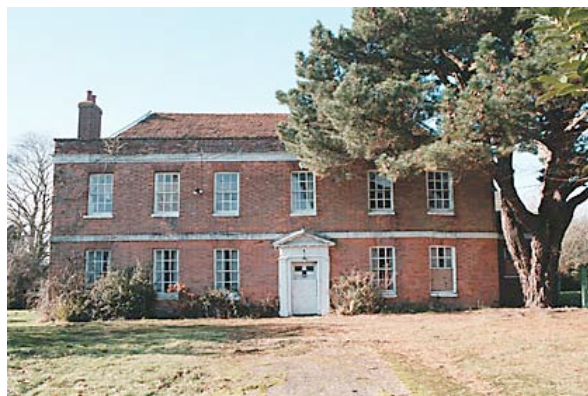
Brook House in 2007. It has since been allowed to deteriorate at an alarming rate

Brook House is a Grade II listed, mid-18th-century house and the kind of property that would ordinarily have a price tag of £1 million plus.