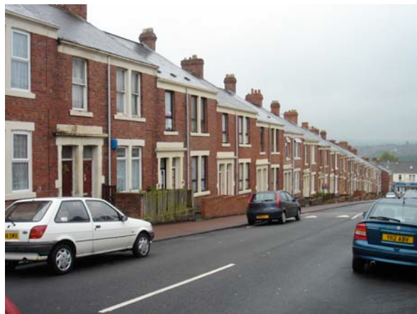
Houses successfully refurbished close to the proposed clearance area in Saltwell, Gateshead. Surely now the council will abandon its plans for demolition

European court has forced them to concede to SAVE’s calls for EIA consideration.