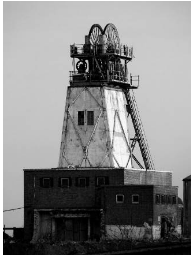
Annesley's distinctive headstock,, nearly all that remains of the conservation area

In spite of a gently resurgent coal industry, the heritage of the coal industry has been steadily disappearing since the closures that followed the miners' strike. The range of buildings associated with the collieries is large, from schools to clubs to bathhouses to headstocks - an area that ought to be investigated in greater detail.