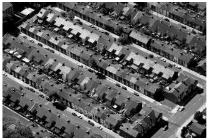
Houses in the Welsh Streets, Liverpool, threatened with clearance.

The Inspector at the inquiry into the Edge Lane clearance area in Liverpool ( SAVE Newsletter Nov / Dec 2006) came to the shocking conclusion that the area could be compulsorily purchased for clearance. It appears, surprisingly, that many of the residents' arguments were overlooked by the Inspector. One weakness on the residents' part, and one from which other groups campaigning for the historic environment across the nation can learn, is that they were not formally constituted, leading to the Inspector giving less weight to their arguments. However, the residents have bitten back, launching a legal challenge to the Inspector's decision. Watch this space.