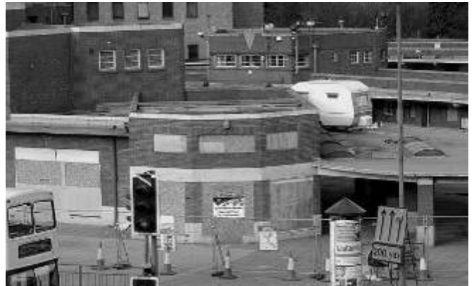
Spot the strategically placed caravan...

The prognosis for Derby Bus Station is looking grim, with demolition due to start this month. SAVE has long objected to the proposals to demolish the 1930s bus station, designed by the municipal architect, Charles Aslin (see SAVE Newsletter October 2001).