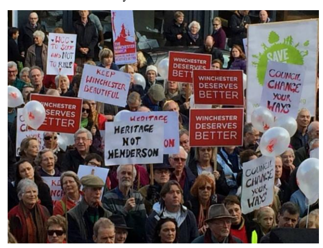
The protest against the proposals, organised by Winchester Deserves Better.

SAVE is now working on an alternative scheme for the site, that will enhance the city and its historic character.