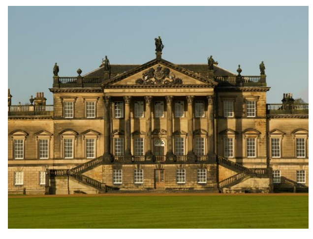
The east front of Wentworth Woodhouse

The campaign to save Wentworth Woodhouse for the nation continues in earnest, following the announcement of our plans in our winter 2014 newsletter (see below for background information).