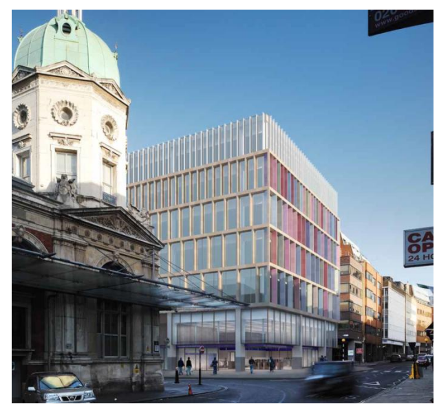
The proposed above-ground development at Farringdon East Crossrail station.

We hope this outcome will lead to the opening of dialogue between the applicants and SAVE and other objectors. However we understand the applicants may now be seeking to appeal the decision, rather than take on board and address the reasons for deferral.