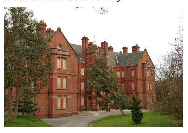
Andrew Gibson House

SAVE launched a petition calling upon the owners to reconsider their plans, which garnered over 4,000 signatures in a very short space of time. The Liverpool Echo dedicated several full page features to the story, which was picked up nationally by Building Design and Private Eye . This led to a meeting with Nautilus, at which SAVE's northern caseworker Jonathan Brown secured a commitment from the union to at least receive offers to restore the building.