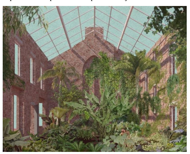
Assemble's design for a communal winter garden in the shell of a terraced house

In a scheme devised by the local Community Land Trust and Steinbeck Studios, new and renovated homes will be owned by new and long-term residents. This is a positive departure from the top-down approach of Pathfinder, which handed publicly-acquired land to private developers and major social landlords.