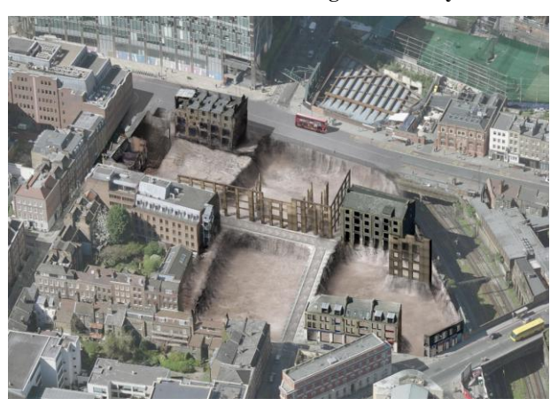
CGI Visual showing the scant amount of historic fabric to be kept

There is still time to object to the proposals by writing to Beth Eite at Tower Hamlets noting the harm caused to the conservation area, the treatment of historic buildings, the height and massing of the new buildings, and the poor consultation process which failed to respond to local objections.