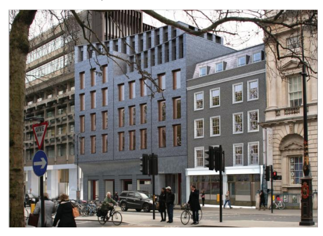
The proposed building

The campaign has been taken up with gusto by The Times , who printed a leader 'Nasty and Brutish' on May 9th. Since then there has been a steady stream of letters, comments and articles in the newspaper. There has been ample coverage, also, in The Evening Standard , Country Life , Building Design , the Architects' Journal , and on the BBC and London Live.