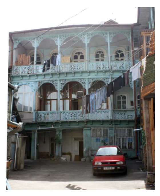
Courtyard building in Kala, Tbilisi

We need to raise a further £8,500 and plan to proceed to publish this year. There is not a moment to lose - an extremely ambitious hotel project called Panorama that involves the construction of four multifunctional complexes at four highly visible spots in Old Tbilisi, two of them in the hills around the city, is in development at present, despite strong local opposition.