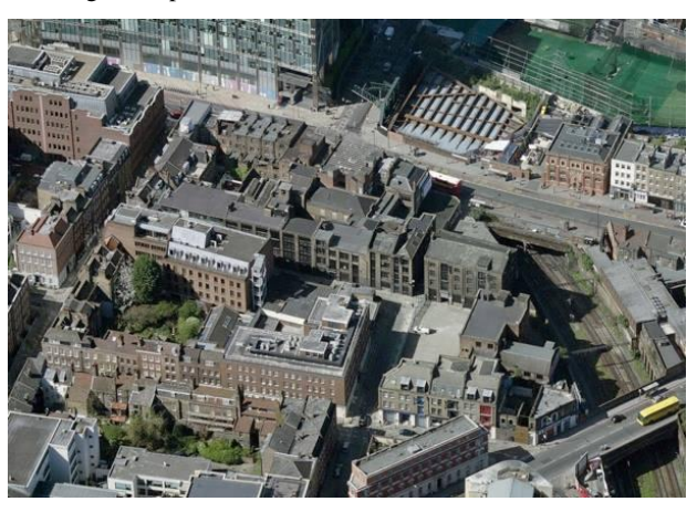
CGI visual of Norton Folgate currently

These proposals are vastly out of scale with the conservation area (existing buildings are three, four and five storeys), and seek to take their cue from the larger blocks over the road in the City of London. In addition the diverse mixture of buildings and uses will be lost amid corporate office blocks with large floorplates.