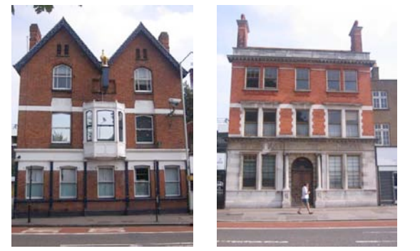
The Red House (left) which once housed the Spurs boardroom, and the Dispensary (right) are to be retained in the new scheme for the site.