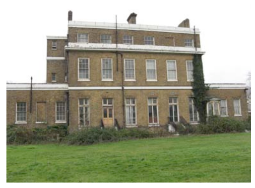
The garden front of Dockyard House, Sheerness.

The most recent application sought permission to build three new blocks of flats within the grounds of the houses, and breach the dockyard wall for a new access road. SAVE felt strongly that this scheme would degrade the historic landscape and deter restoring owners from bringing the historic buildings back to life. Also, rather than being a condition of the consent, the repair of the listed buildings was to be the subject of a 'unilateral agreement' between the owner and the council something SAVE felt was deeply unsatisfactory. In objecting to the scheme, SAVE was joined by the World Monuments Fund Britain, the Georgian Group, the Naval Dockyard Society and a number of local groups. Despite a recommendation for approval by the council officers, the planning committee refused the scheme unanimously.