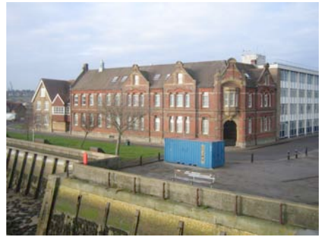
The Aveling & Porter Offices.. Demolishd for a car park.

One of the saddest and most frustrating cases of the last year has been the Aveling & Porter Building in Strood. This fine Edwardian block, once home to the worldrenowned manufacturers of steam rollers was owned by Medway Council which, in January, began demolishing the block as part of a plan to sell the site for redevelopment. As one of the few local landmarks of interest and quality in the vicinity the A&P building should have been cherished. Furthermore, it was in good condition and ripe for conversion.