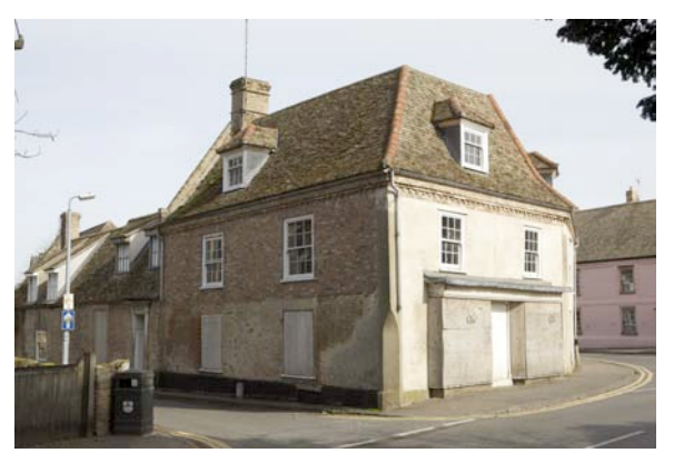
2 Church Street, Isleham, Cambridgeshire, featured in this year's BAR catalogue.

The hunt is on for candidates for next year's buildings at risk catalogue and register. We are looking for interesting buildings in England and Wales (Scotland and London are not covered). They can be of any type, listed or unlisted, provided they are vacant or partially vacant. In terms of listed buildings, we tend to focus on Grade II to avoid duplication with English Heritage's own register which covers Grade I and II* buildings and Grade II in London.