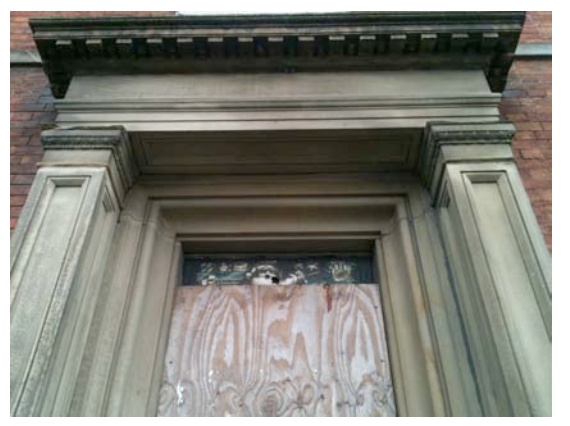
The handsome stone doorcase at 53 King Street, Blackburn

The Grade II listed house, most recently a police station, is on the edge of Blackburn's 'Georgian quarter' but now stands isolated following the loss of adjacent buildings. It is a building of very high quality, finely proportioned and sturdily built with crisp stone dressings and elegant ironwork with Grecian detailing. Campaigners argue that the new road could be routed elsewhere. An application for 'sensitive demolition' (whatever that may be) was first submitted last year, drawing strong objections from SAVE, the Georgian Group and the Heritage Trust for the North West. This was thankfully refused, but the future of the building remains uncertain.