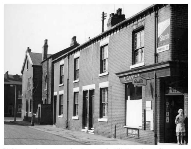
Nothing more than a memory: Toxteth Street in the 1960s. The entire area has now been flattened, even though redevelopment plans have stalled.

The latest news from Manchester is that demolition has now started on some of the existing blocks. With the renewal project not due for completion until 2019, parts of this once thriving neighbourhood look likely to be left as wastelands for years to come. Meanwhile, in a move which encapsulates the lunacy of Pathfinder, the City Council allowed apprentices from a local college to repoint the brickwork on one of the condemned blocks as part of a training programme.