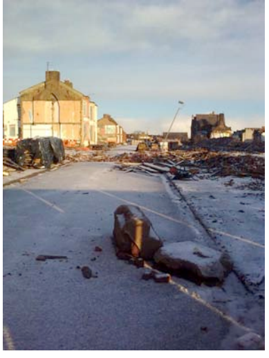
A partly demolished street in the Edge Hill area of Liverpool.

A damning report in Property Week quoted some stark figures on the state of the government's disastrous Housing Market Renewal (Pathfinder) scheme. It revealed that, to date, the scheme has cost £2.2 billion and knocked down four times as many homes as it created. Yet, despite many stalled schemes and a widespread realisation that the policy has been a disaster, the juggernaut rolls on, and good terraced housing continues to fall to the bulldozers. In recent years SAVE has concentrated its efforts in two areas, Bensham, Gateshead and Toxteth Street, East Manchester.