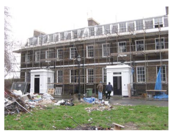
Regency Close, a terrace of fine houses for Naval Officers dating from the 1820s.

Also surviving is a complete residential quarter, unique to any dockyard of this date. Regency Close includes an elegant terrace of 5-bay officers houses and the imposing Commissioner's House (all Grade II*). Since being sold to a developer nearly a decade ago this group has been empty (save for a single tenant) and subject to various proposals for new housing which have prompted strong local and national opposition.