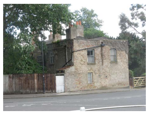
Crossways in Ealing: up for auction after two failed bids for demolition consent.

accompanying the application referred to the costs of repair as 'incalculable'. SAVE disputed this, arguing that any qualified historic buildings surveyor could easily give an approximate cost for this work. We also pointed out that many of the building's structural problems are the result of deliberate neglect and could not therefore be used as a reason for its demolition.