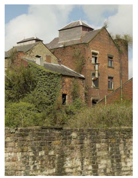
Mitchell's Brewery, Lancaster, listed Grade II after its Malthouse was found to date from 1751.

In the last newsletter SAVE raised concerns over the vulnerability of Mitchell's Brewery at the heart of the disputed Canal Corridor North site in Lancaster. The brewery complex, which incorporates 18th-century elements, was unlisted and sited between (and outside) two conservation areas.