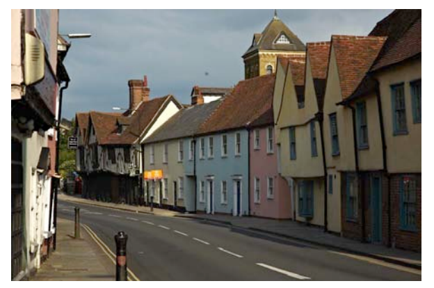
Colchester has buildings of the highest calibre from nearly every era - here jettied mediaeval buildings jostle with later cottages and an old mill complex

Colchester is one of England's most overlooked historic county towns. It retains its Roman grid, with a castle, town walls and street after street of handsome buildings. This report aims to highlight the wealth of Colchester's built heritage, show the good work that has been done in conserving and augmenting these assets, and put forward ideas for the future - from the small scale to the highly ambitious.