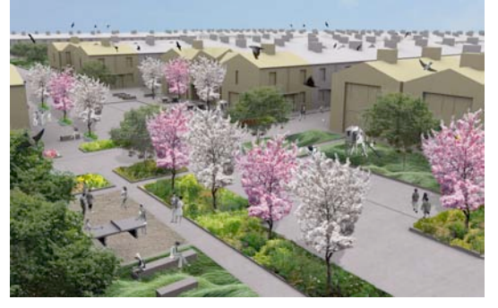
Mark Hines shows how terraced housing destined for clearance can be rejuvenated and reinvented as eco-communities. © Mark Hines Architects

New Labour's Housing Market Renewal (Pathfinder) Initiative has resulted in the destruction of thousands of terraced houses across the north of England, ripping the heart out of communities and repeating the terrible mistakes of the 1960s and '70s.