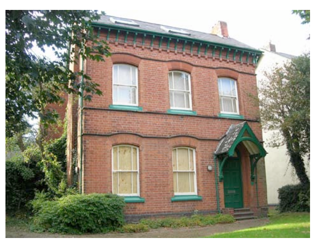
42 Flint Green Road, Birmingham

The houses in Flint Green Road were sold privately, ahead of auction, raising fears that they were earmarked for redevelopment. Despite forming part of a coherent and elegant group, they are not part of a conservation area so are particularly vulnerable. In March SAVE wrote to the council calling for these fine villas and those on neighbouring roads to be afforded conservation area protection.