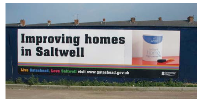
Glossy posters in Gateshead cover good terraced houses left empty and decaying by the council

In 2008 SAVE's lawyers intervened to prevent the demolition of around 130 houses as part of a wider clearance programme in Bensham, a Victorian suburb of Gateshead. Since then SAVE has successfully thwarted repeated attempts by the council to send in the bulldozers. Having successfully quashed demolition consent twice, SAVE is now attempting a hat trick - having secured a further injunction in April. Sadly, this