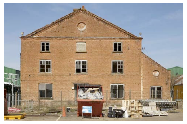
Vacant for decades: the extraordinary Symonds Farmhouse, The Saxhams, Suffolk, which features in Live or Let Die.

Since our last Newsletter no less than four new SAVE publications have become available. They cover a range of subjects and there follows a brief description of each. These reports can be ordered via the website or by using the order form in this newsletter (or on the enclosed leaflet). In the New Year we hope to add a substantial report on London Churches to this list.