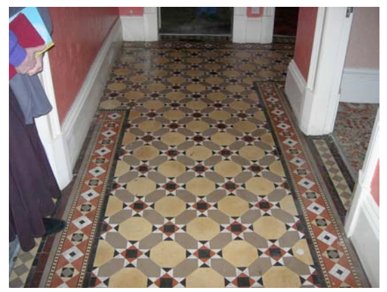
Minton tiling in the entrance hall at 44 Flint Green Road

In a plea to preserve the villas SAVE's President, Marcus Binney, described them as 'charming and attractive with a wealth of lively detail – arch headed windows, gabled porches, bracketed cornices built in warm, soft, brick.'